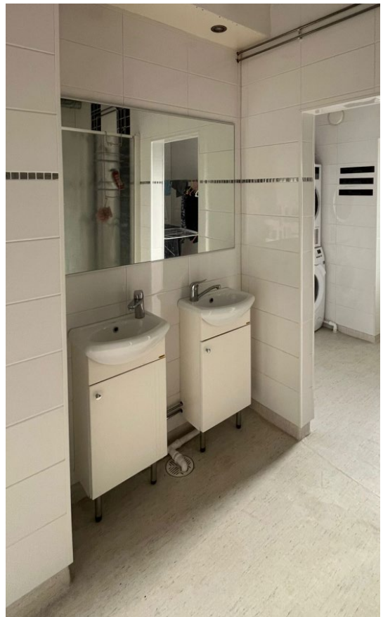
Rautatienkatu 3B4, 26100 Rauma