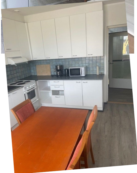
Varustajanvahe 11, Rauma